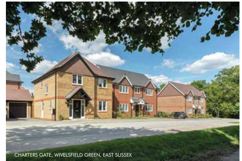
CHARTERS GATE, WIVELSFIELD GREEN, EAST SUSSEX