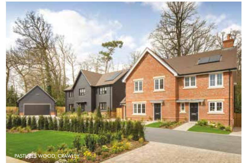
PASTURES WOOD, CRAWLEY