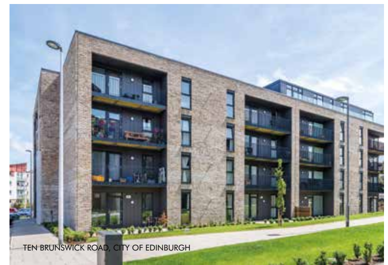
TEN BRUNSWICK ROAD, CITY OF EDINBURGH