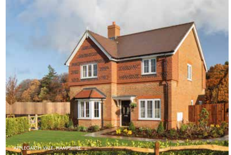
APPLEGARTH VALE, HAMPSHIRE