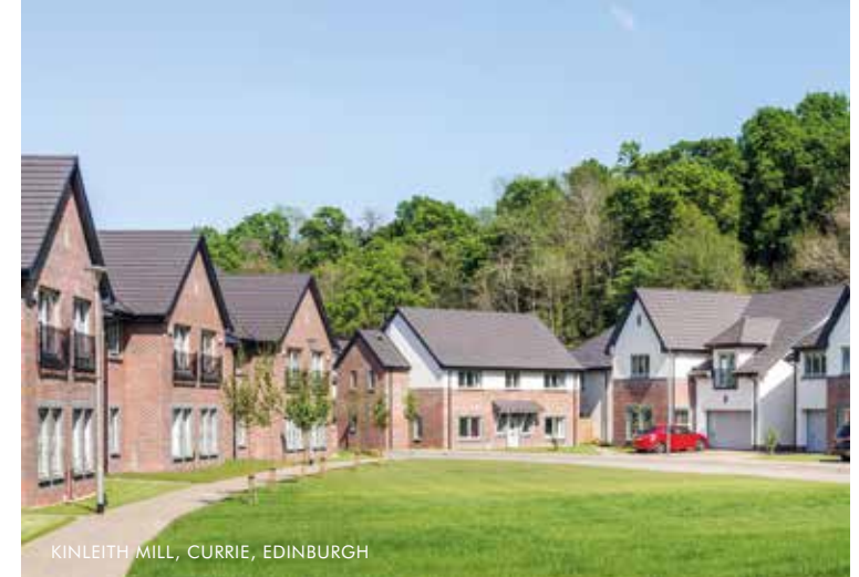
KINLEITH MILL, CURRIE, EDINBURGH