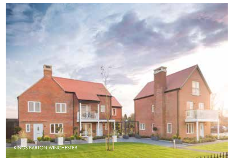
KINGS BARTON WINCHESTER