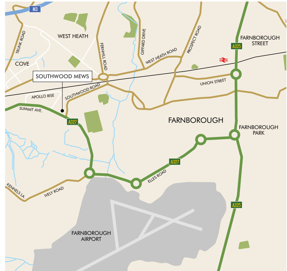
LOCAL AREA MAP