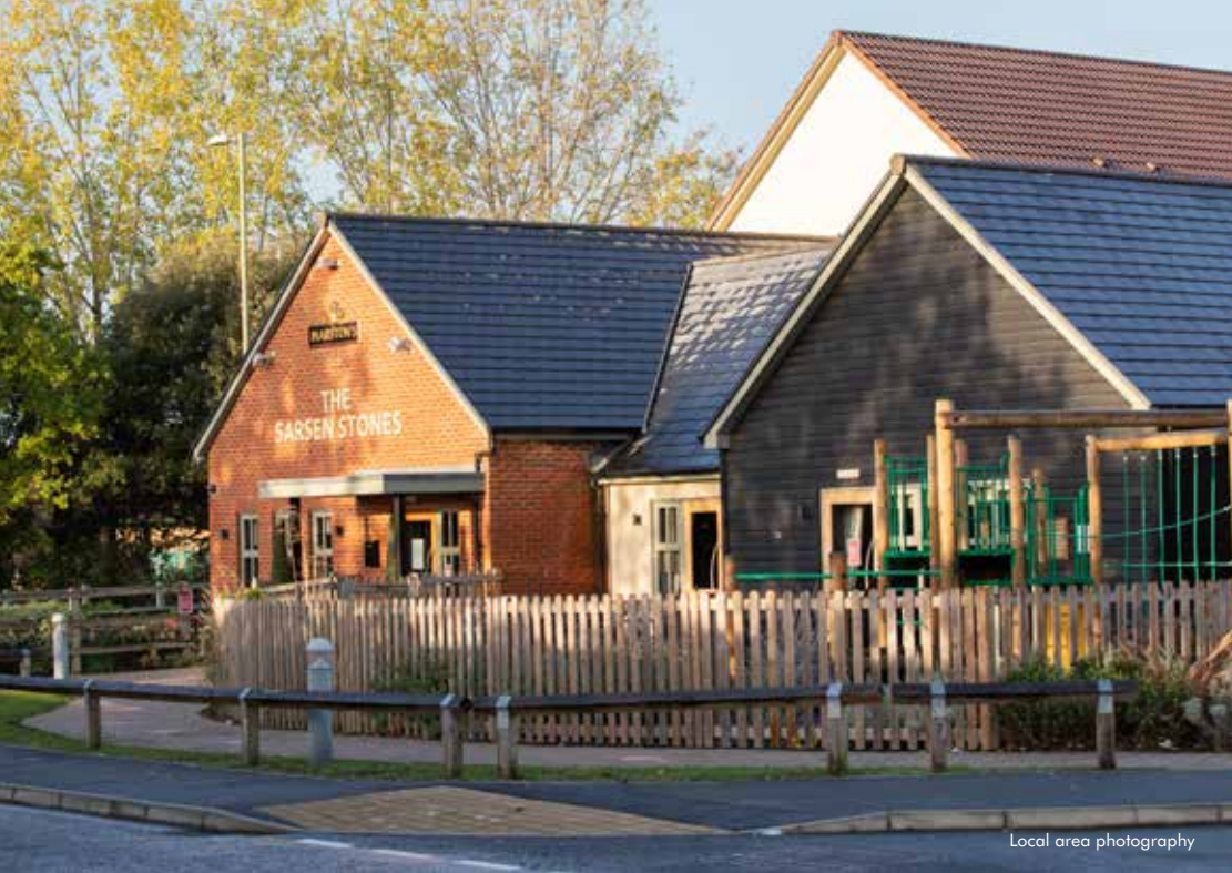
Local area photography