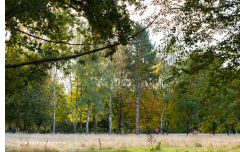
Local area photography

Whether you're a first time buyer, a growing family or a commuter looking for a more relaxed lifestyle in a town surrounded by charming Hampshire countryside, Southwood Mews in Farnborough is a great place to call home.