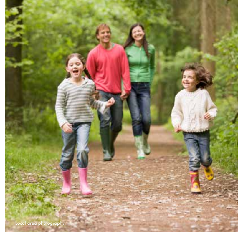
Local area photography

Distances and journey times are approximate and are taken from Google Maps and www.thetrainline.com