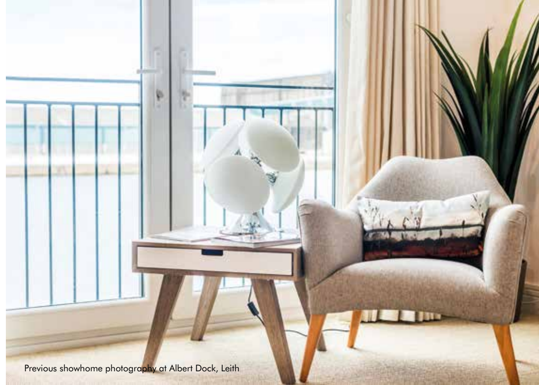
Previous showhome photography at Albert Dock, Leith