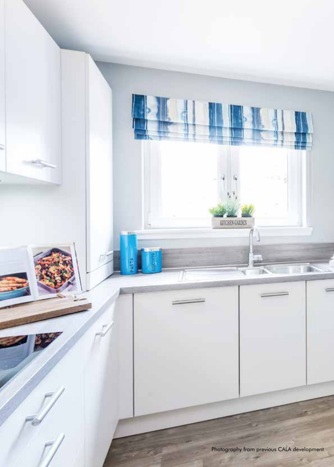
Photography from previous CALA development