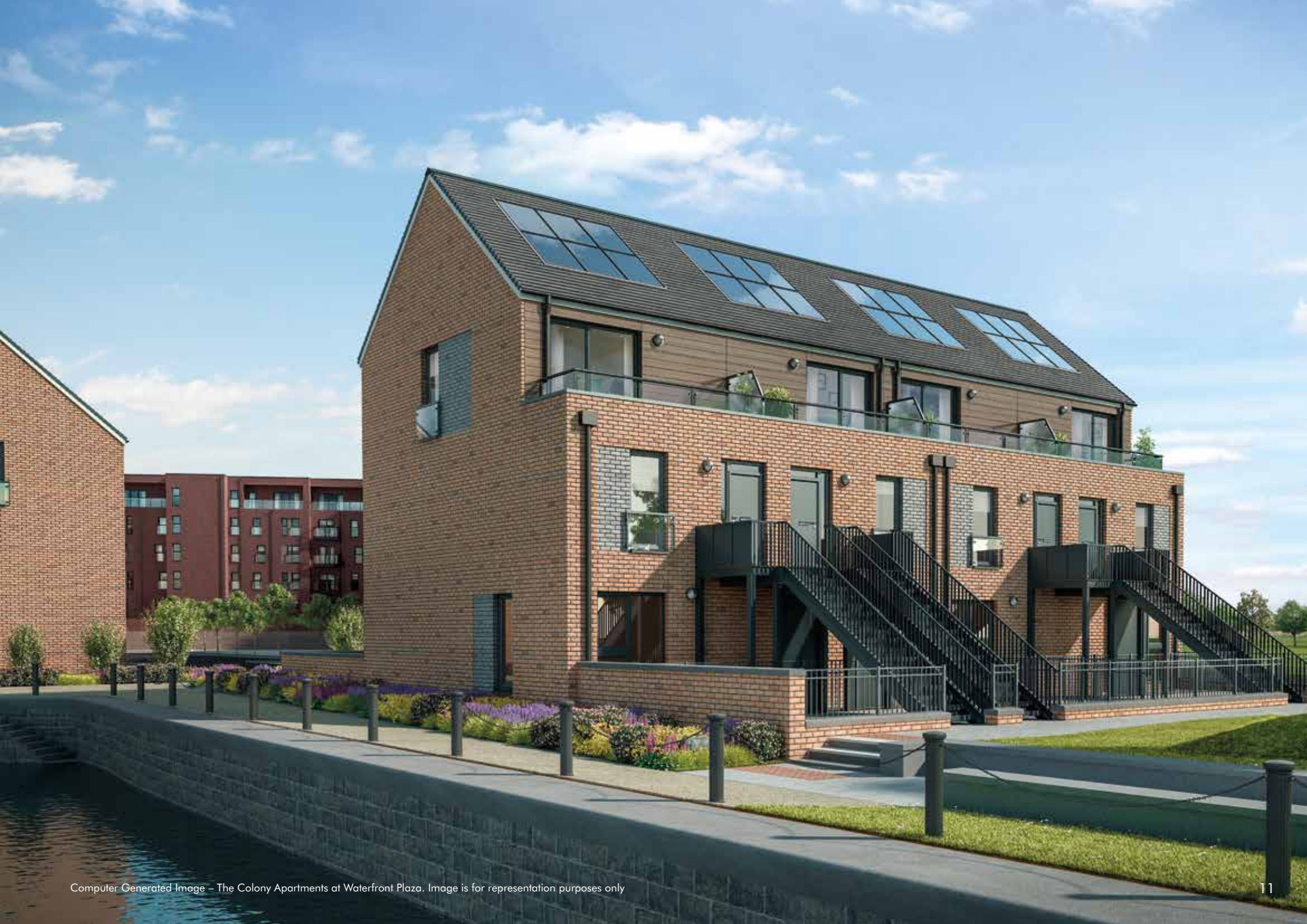
Computer Generated Image – The Colony Apartments at Waterfront Plaza. Image is for representation purposes only