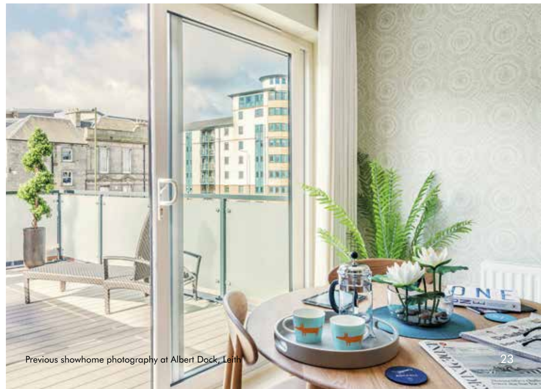
Previous showhome photography at Albert Dock, Leith