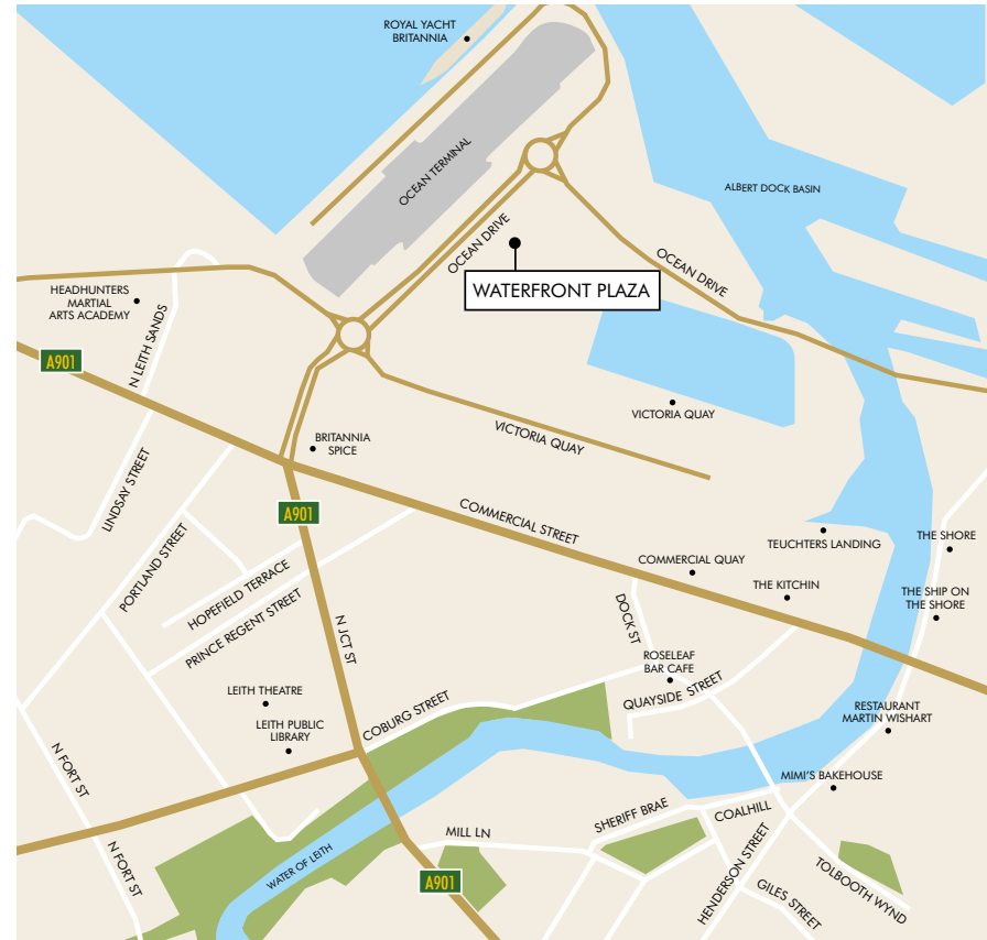
LOCAL AREA MAP