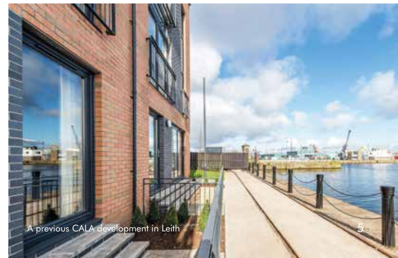
A previous CALA development in Leith