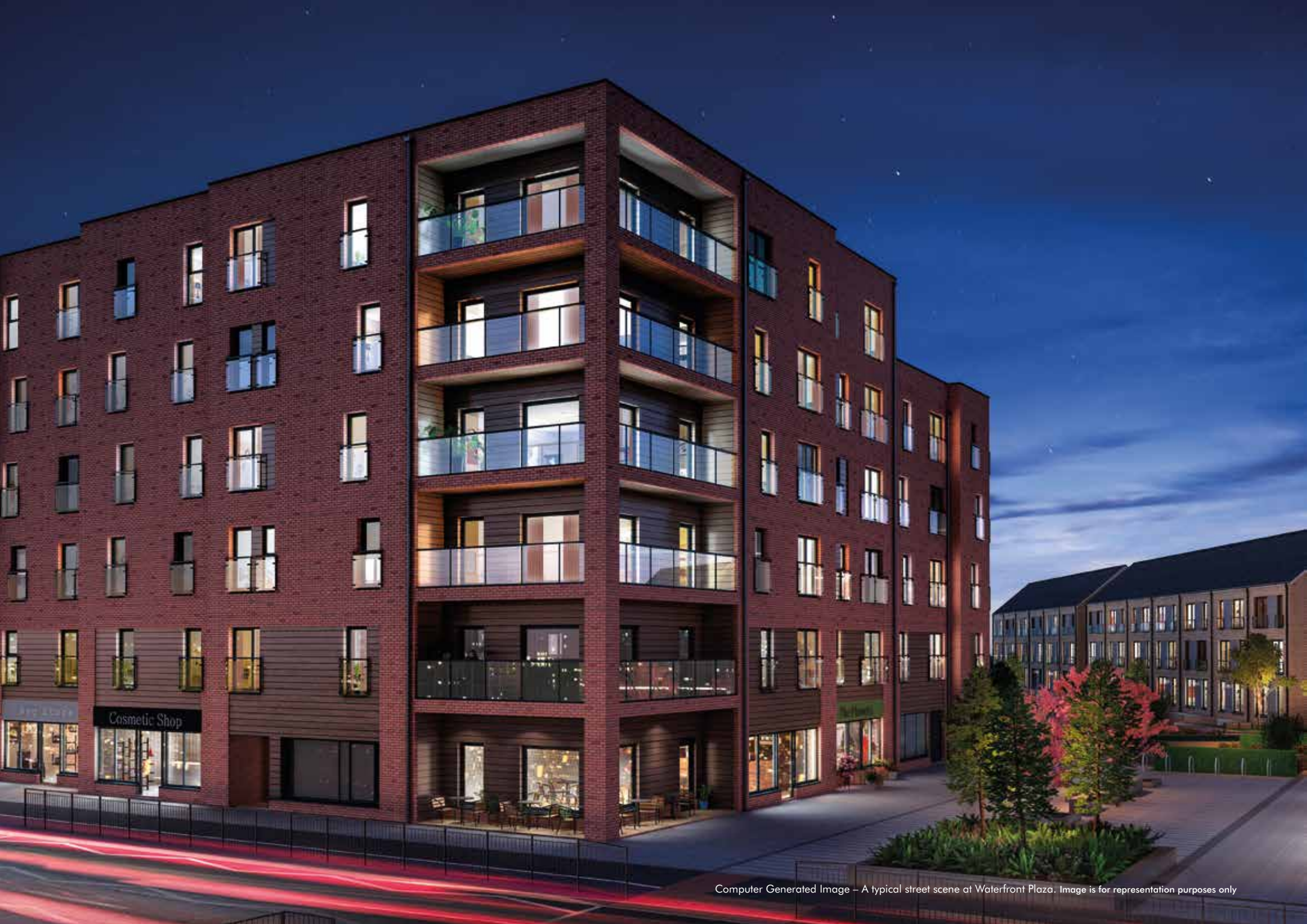
Computer Generated Image – A typical street scene at Waterfront Plaza. Image is for representation purposes only