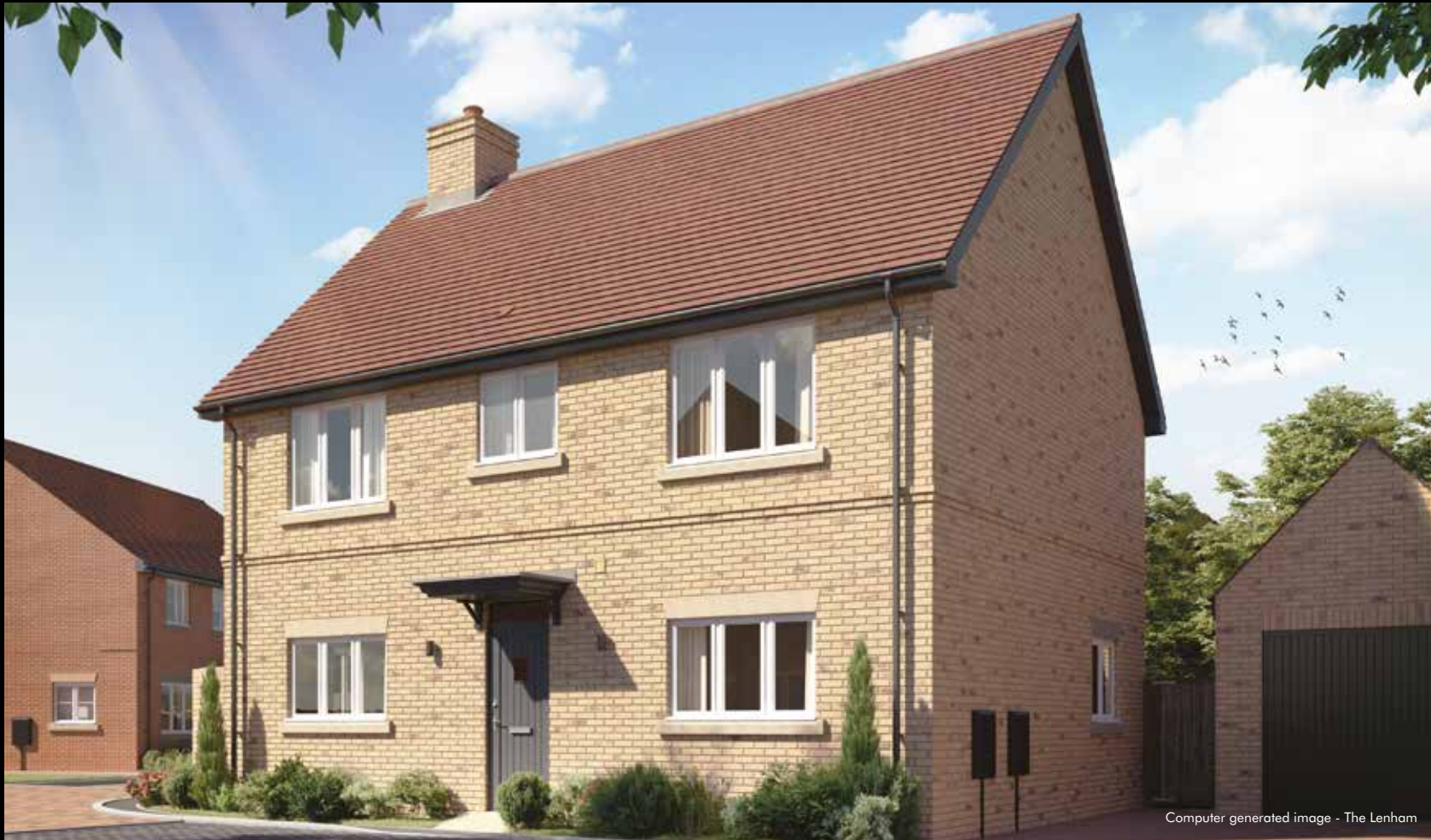
Computer generated image - The Lenham